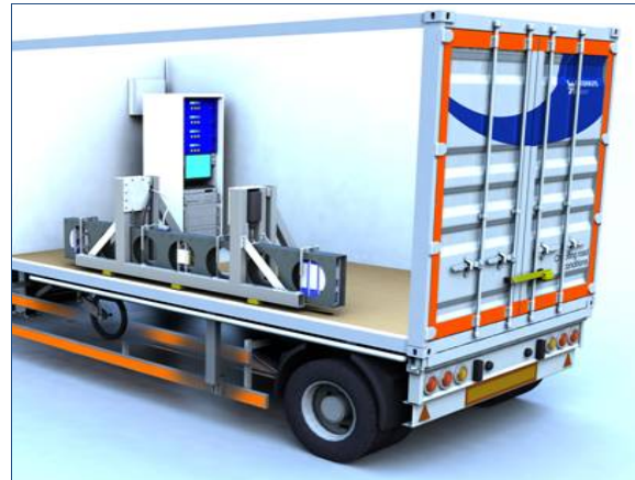
Picture of two TSD machines at the TRL test track and computer generated schematic